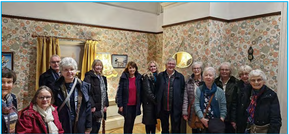
LH6 members enjoyed posing in Wallace's famous living room.