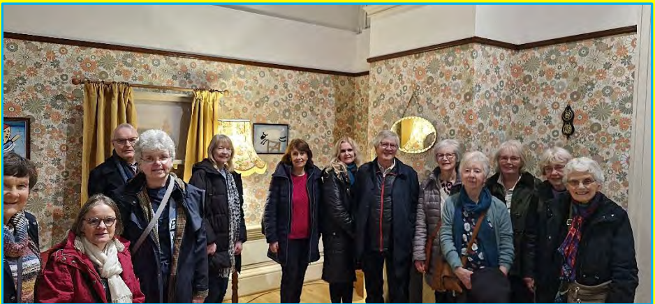
LH6 members enjoyed posing in Wallace's famous living room.