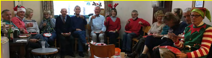
The group enjoyed their Christmas gathering.